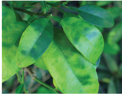
USDA, Hilda Gomez

Trees and plants that are infected with citrus greening disease may not show symptoms for years. As the disease moves within the tree, it is not uncommon for whole branches, and eventually the entire tree, to turn yellow progressively. One of the most characteristic foliage symptoms of citrus greening is blotchy mottling (fig. 5) of the leaves and yellowing of leaf veins and